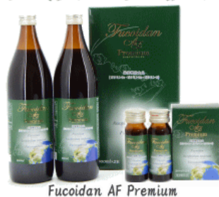
Fucoidan AF Premium